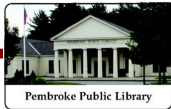
Pembroke Public Library